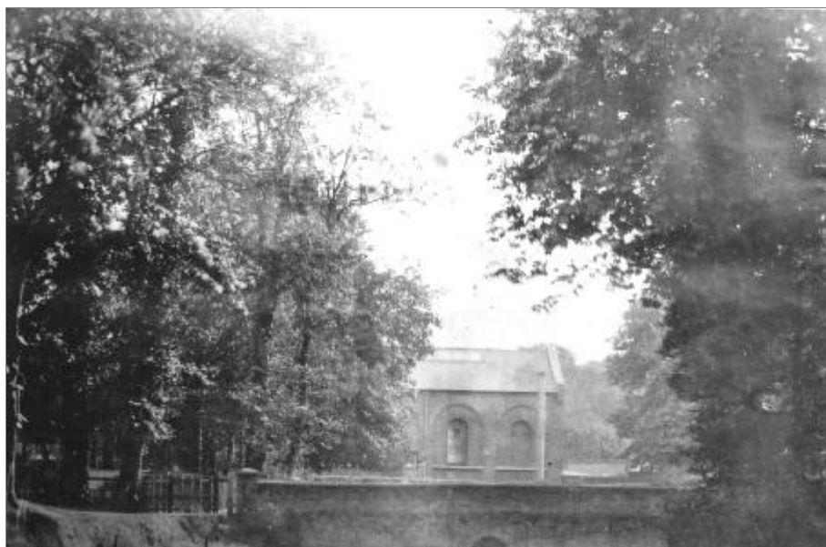
The Coldstream (or Bathing Place) was a natural pool of water by the Lower Addiscombe Road where Havelock House now stands, opposite Havelock Road. You can see the Gymnasium, that still exists, in Havelock Road.

We had to work hard to find early pictures of our area for the books. It would be good if you could send us any pics (in whatever form, old or new) so