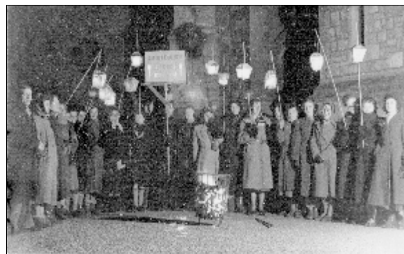
Carol Singers outside St Mary Magdalene late 1950s from The Book of Addiscombe Vol II

Get into the spirit of Christmas. It's traditional (see photo from late 1950s) and it's fun! Join the singers with lanterns and handbells on Wednesday 20 December, starting at 7.15 pm, on the corner of Stretton and Morland Road, or on Saturday 23 December at the same time on the corner of Nicholson and Lower Addiscombe Road. You don't have to be a church member to take part. Refreshments afterwards! Proceeds to the Children's Society. Listen out for them - they'll be visiting you!